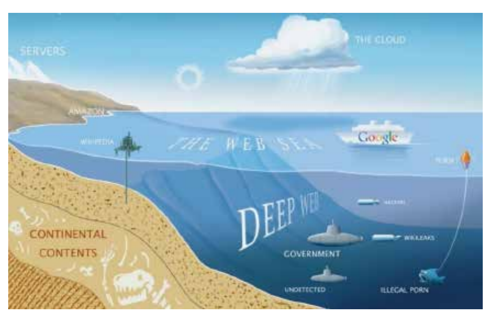
FIGURE 1. The Surface Web vs. the Deep Web

Web) – the portion of the web that has not been crawled and indexed, and thus is beyond the sonar reach of standard search engines. It is technically impossible to estimate accurately the size of the Deep Web. However, it is telling that Google – currently the largest search engine – has only indexed 4-16 percent of the Surface Web. The Deep Web is approximately 400-500 times more massive than the Surface Web (See brightplanet. com). It is estimated that the data stored on just the 60 largest Deep Web sites alone are 40 times larger than the size of the entire Surface Web (See thehiddenwiki.net).